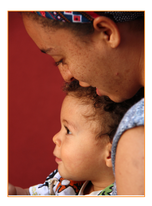
In the face of widespread poverty, South Africa is increasing social grants, which will benefit about 2.4 million more South African children.